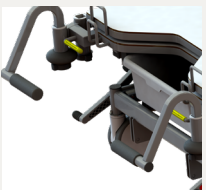
Lower foot supports