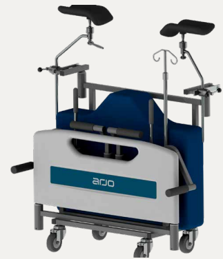
Optional storage trolley