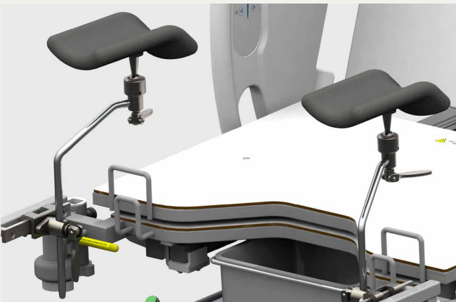
Ergonomically designed, sturdy and reliable leg stirrups