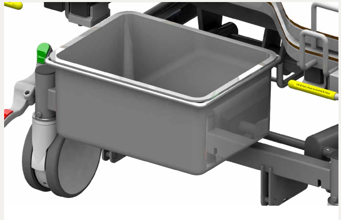
Large under tray