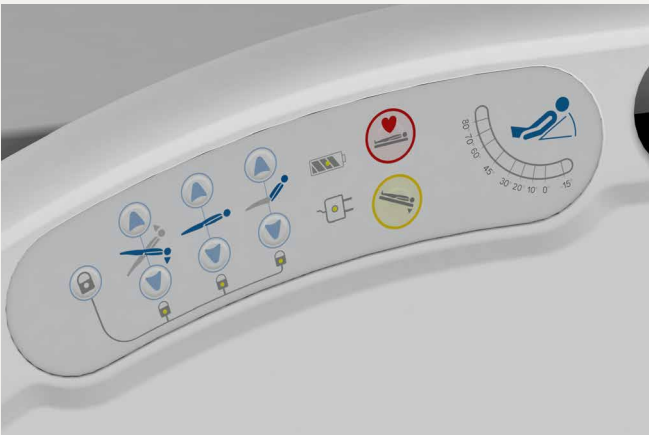
Fully integrated patient and nurse control panels